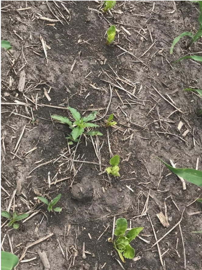
36 months after application