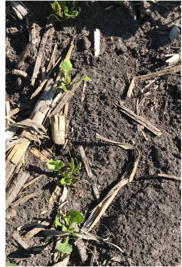
48 months after application